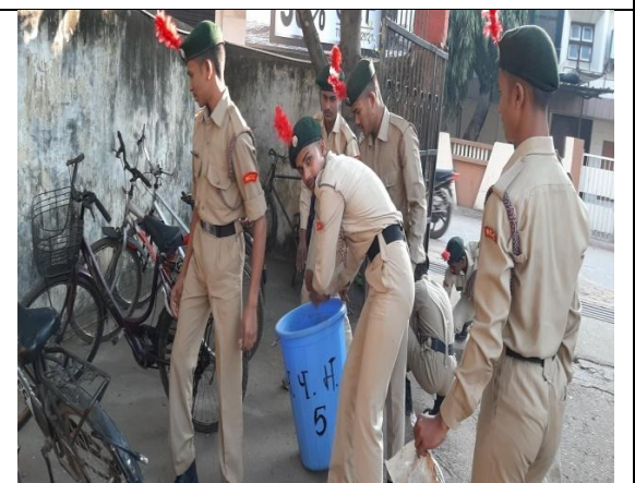
NCC Cadets Cleaning the Campus Area