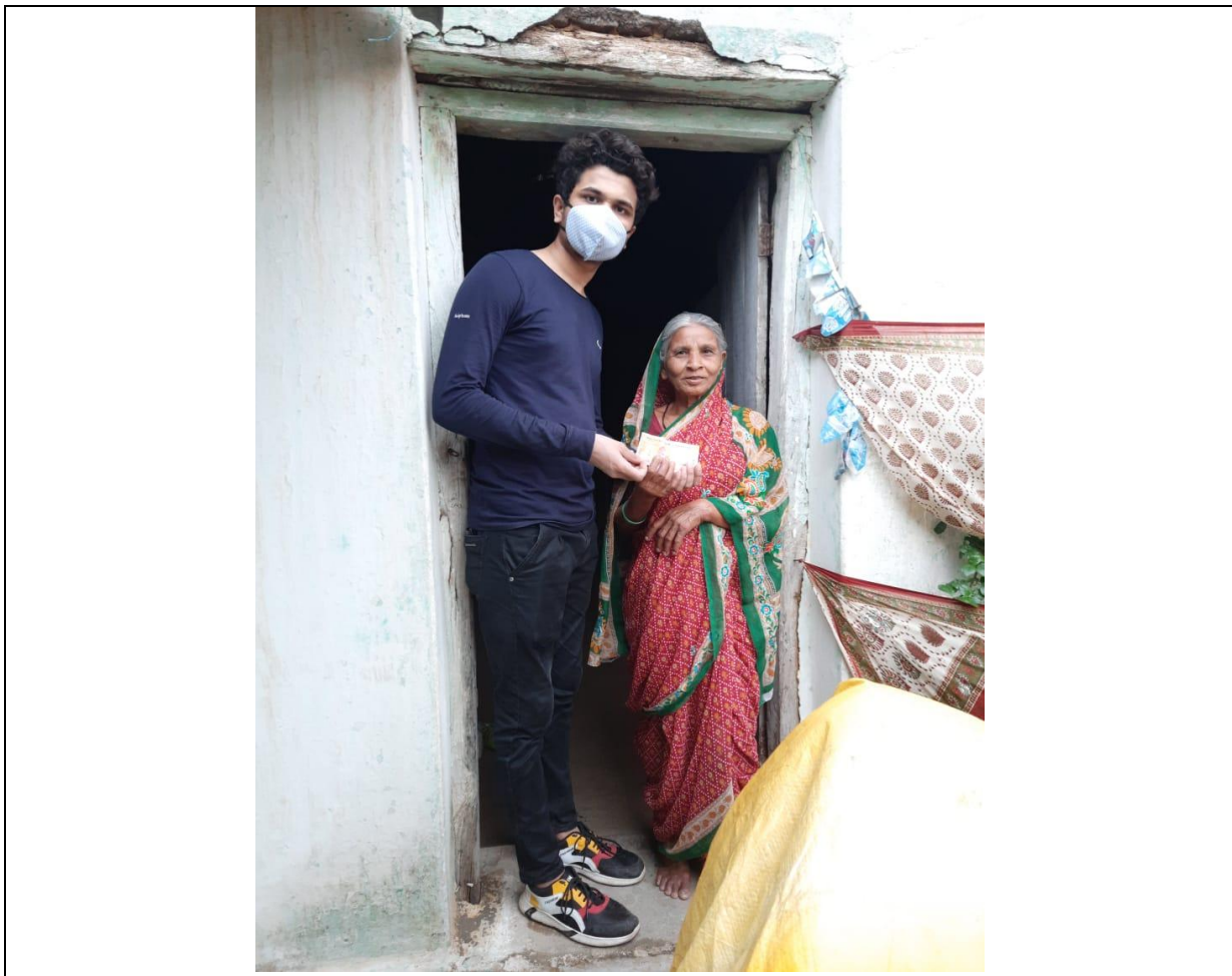
Student Club Members Distributed Grocery items in Rural area On 1 jan 2021