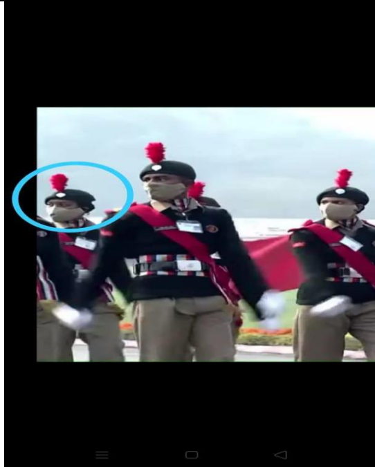
SUO Najuka Kusram Participated in PM Rally at Delhi on 28 th January 2021