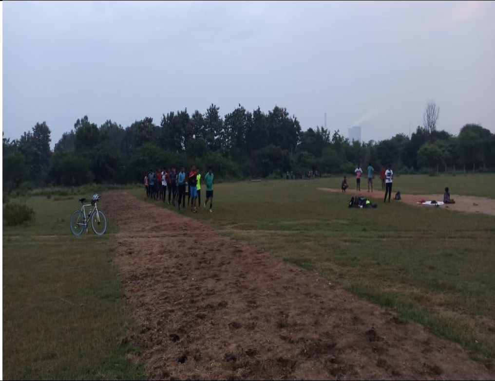
Fit India Movement run by Department of NCC to Servive in Covid -19