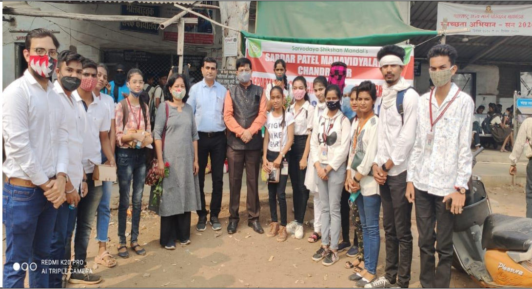
Mask Distribution programmes Organised by Microbial Student Club in Bus Stand, Chandrapur On 5 th FEB 2021