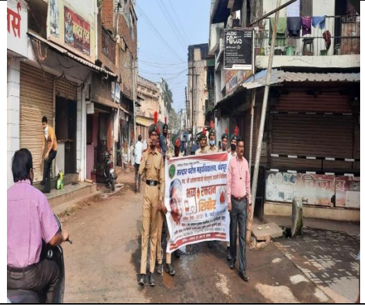
Awareness Rally for Blood Donation Camp